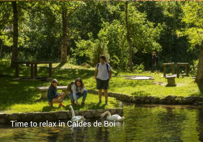
Time to relax in Caldes de Boí