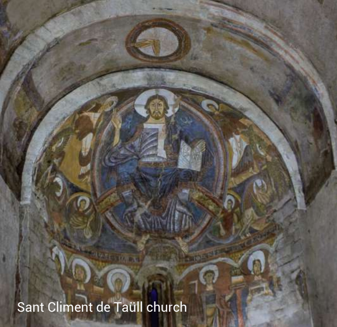
Sant Climent de Taüll church