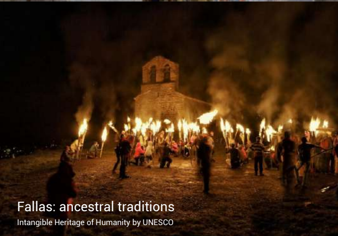
Fallas: ancestral traditions

Intangible Heritage of Humanity by UNESCO