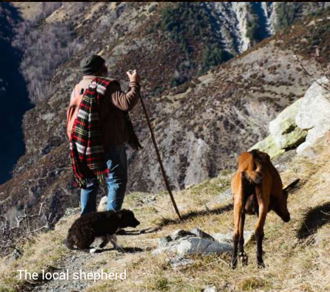
The local shepherd

Intangible Heritage of Humanity by UNESCO