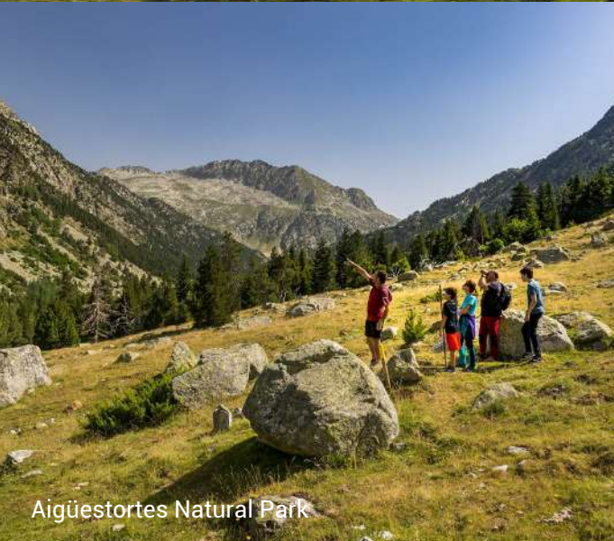
Aigüestortes Natural Park