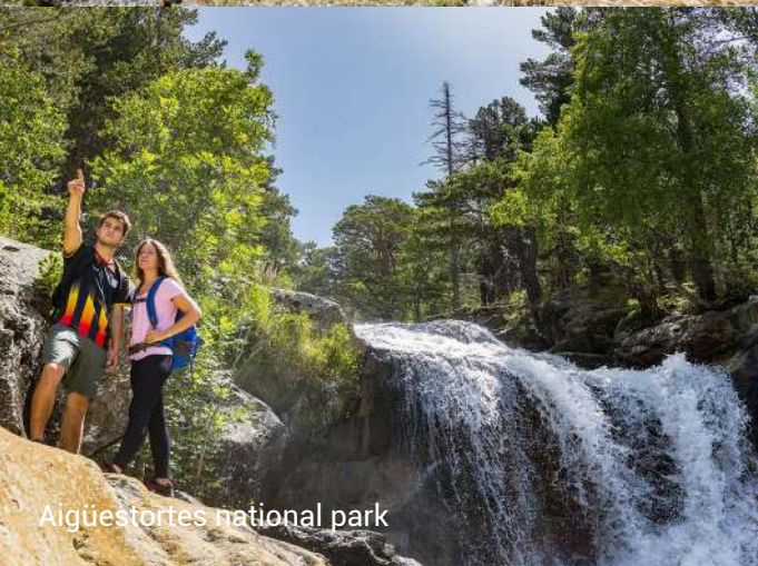
Aigüestortes national park