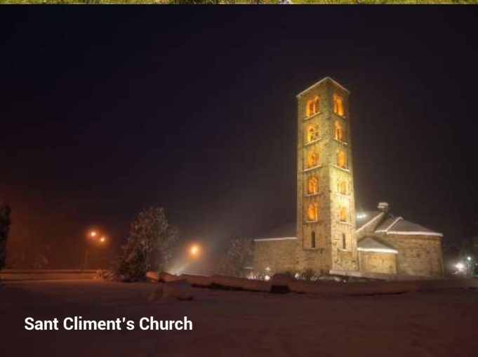
Sant Climent's Church