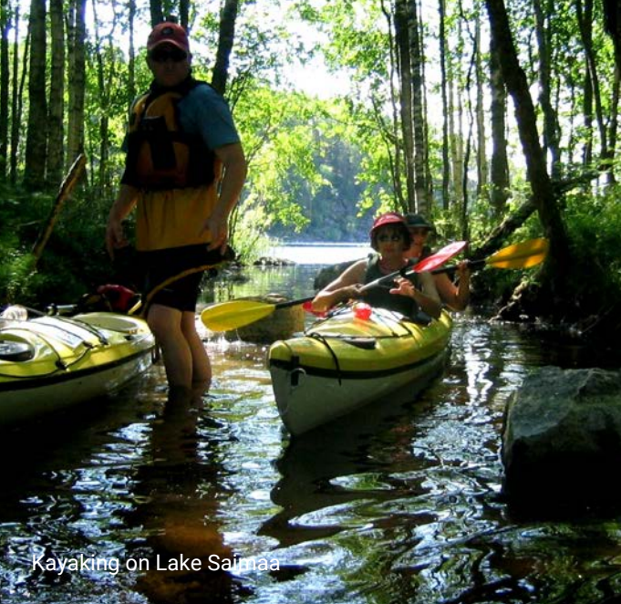
Kayaking on Lake Saimaa