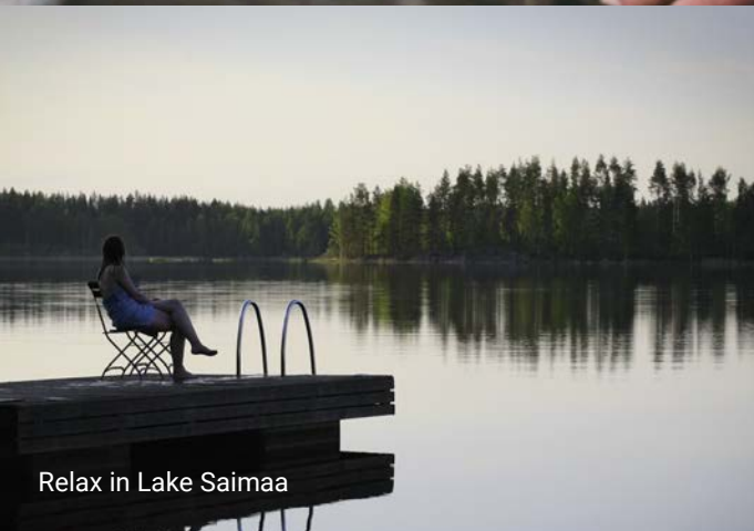
Relax in Lake Saimaa