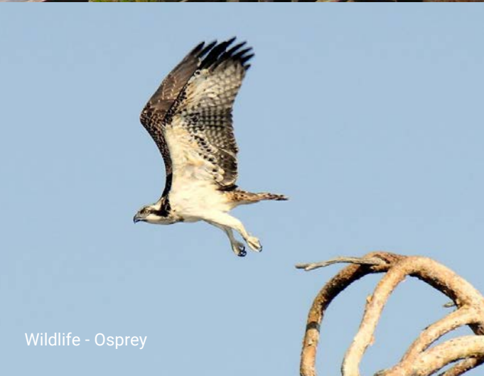
Wildlife - Osprey