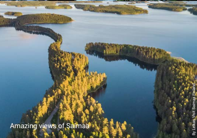
Amazing views of Saimaa