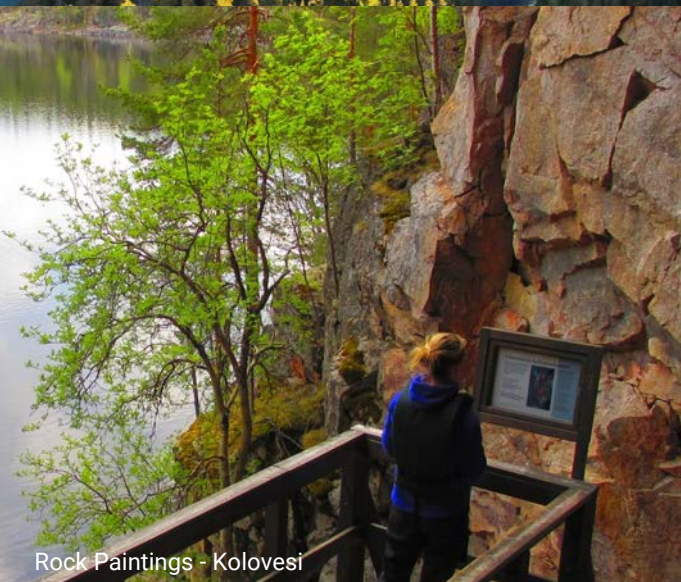
Rock Paintings - Kolovesi