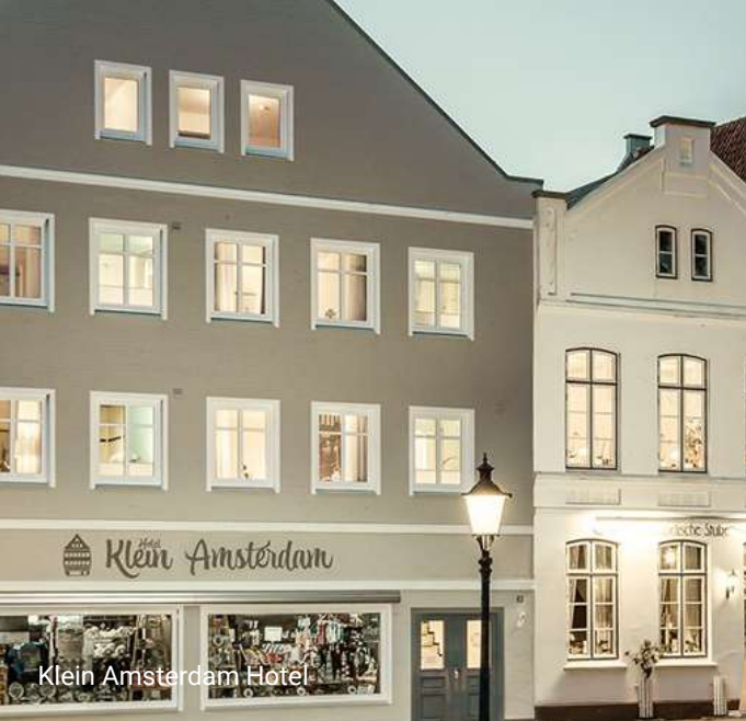
Klein Amsterdam Hotel