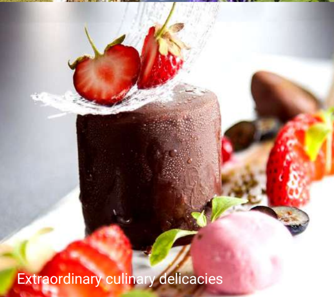
Extraordinary culinary delicacies