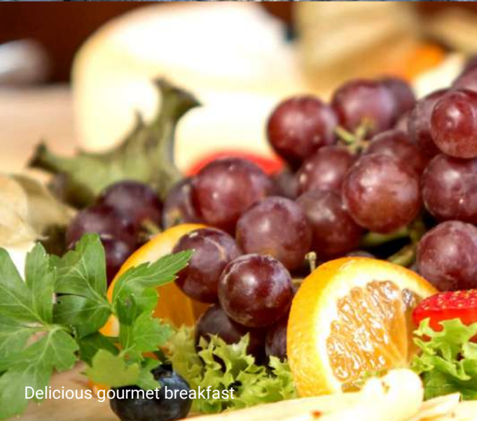
Delicious gourmet breakfast