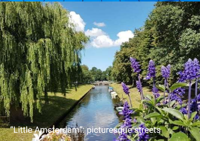
"Little Amsterdam": picturesque streets