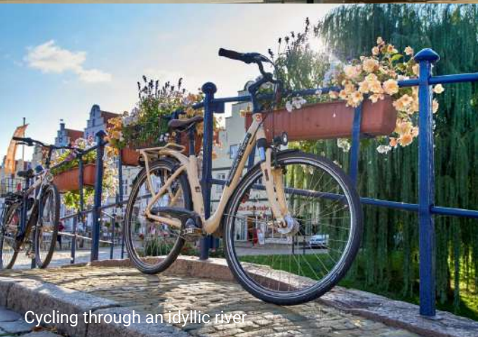
Cycling through an idyllic river