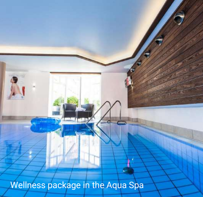
Wellness package in the Aqua Spa