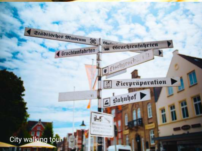
City walking tour