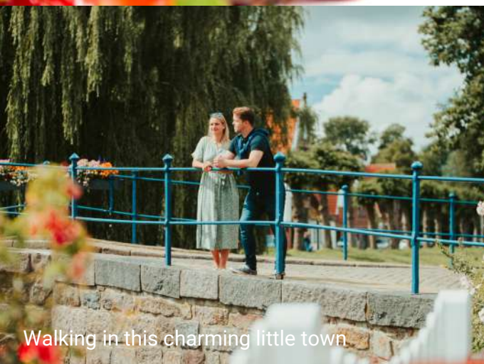
Walking in this charming little town