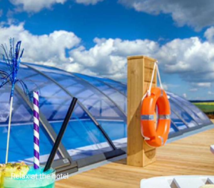
Relax at the hotel