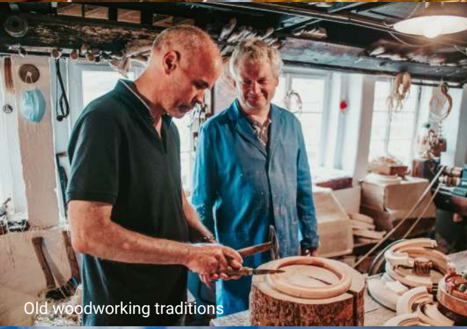
Old woodworking traditions