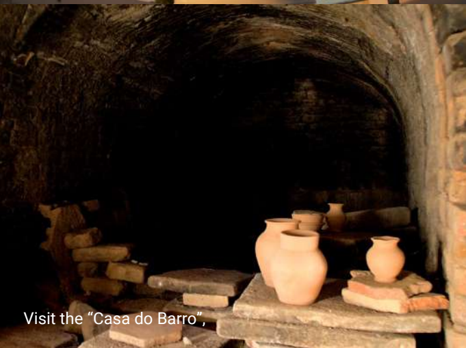
Visit the "Casa do Barro",