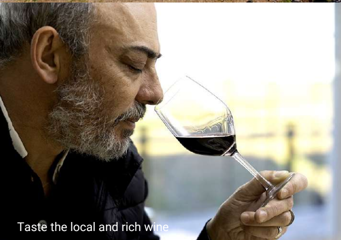
Taste the local and rich wine