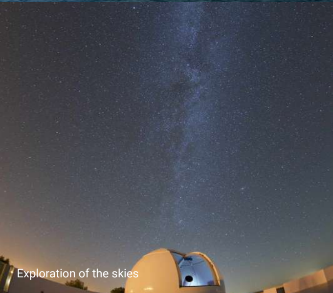
Exploration of the skies