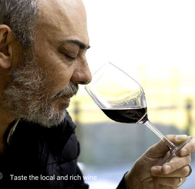
Taste the local and rich wine