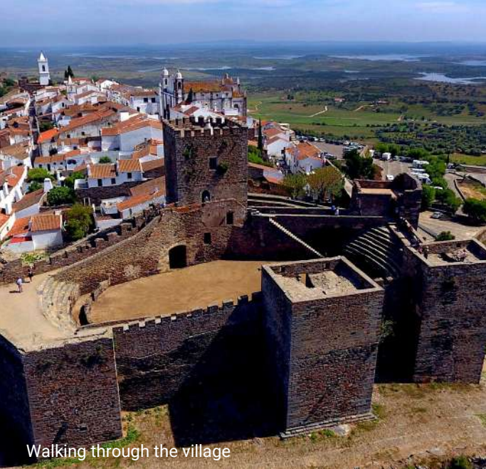
Walking through the village