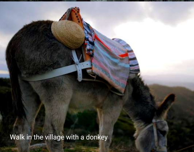
Walk in the village with a donkey