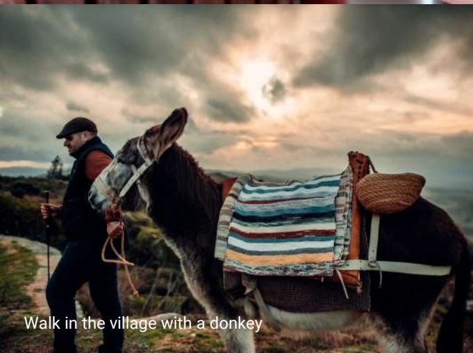
Walk in the village with a donkey